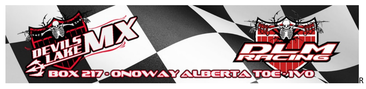
Round #3 - Calgary, Alberta

Calgary had its ups and downs. The weather was cold, wet and windy., but the Devils Lake team always remains positive. We were prepared and ready for what we called our home track race.